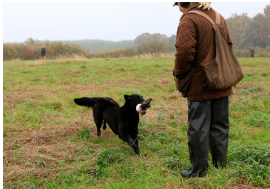
Zebulons Karrakatta and Skattkammarens Isle of Isla – two of the greatest workers during the last few years in the Nordics.