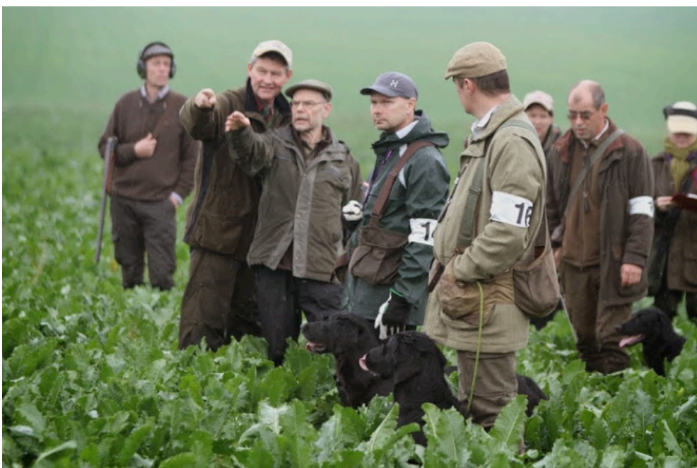
At the Nordic Flatcoated Retriever Championship 2014