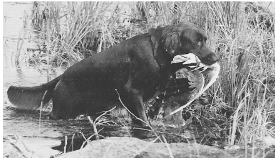
O'Flanagan Free-as-air and Gunhills Cheiron

The bitch Hovhills Kiss-Me-Quick (Quicksilver Courage x Hovhills Lillefix) was mated to Gunhills Cheiron producing 3 Field Trial Champions and in total (3 litters) 9 dogs winning prices in elite class, making her the strongest brood bitch ever in the Swedish Flatcoat history. If we add the two litters sired by Micawber out of Björkhedens Candlelight (Tryggs Flat x Woodland Wistful), with four dogs getting high prices in Elite class we have covered some of the strongest exponents of this golden Flatcoat generation.