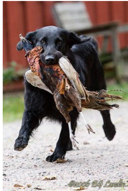
Duckstream Black Velvet and Cragganmore

Her offspring from two litters sired by the Danish top performer Holly Hunter's Woody Guthrie and his half-brother Holly Hunters Jasper have reached a dominant position on the Nordic working scene. Her son Waternuts Man of The Moment gained a 1:st and a Certificate Quality at the Swedish Flatcoat A-test Championship in 2012 when her litter sister Waternuts Sweet Science won the test with a 1:st price and Certificate. From then on, the dog W. Man of the Moment and his siblings, the Swedish bitches Waternuts Caleigh and Waternuts Sweet Science have frequently been in the price lists. At the Nordic Flatcoated Retriever Championship (for teams and individuals) these litter mates have been part of the winning Swedish team from 2010 – 2016. Their halfbrother Waternuts High and Mighty was second best dog in 2015 and 2016 and the winner in 2017 at the individual competition.