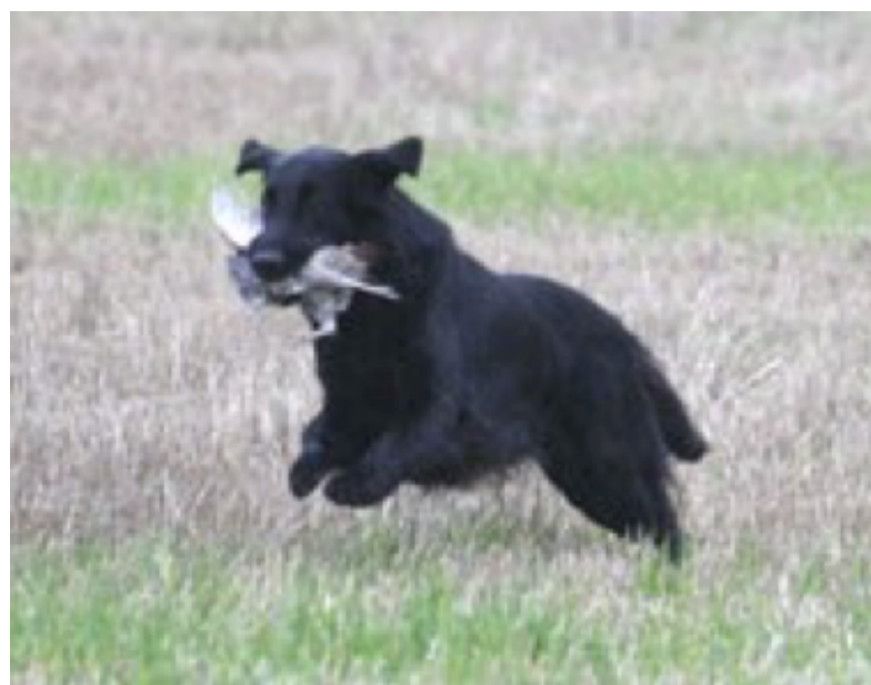
Hinnareds Nitro and Hinnareds Älton John, two great winners out of a long line of top workers.