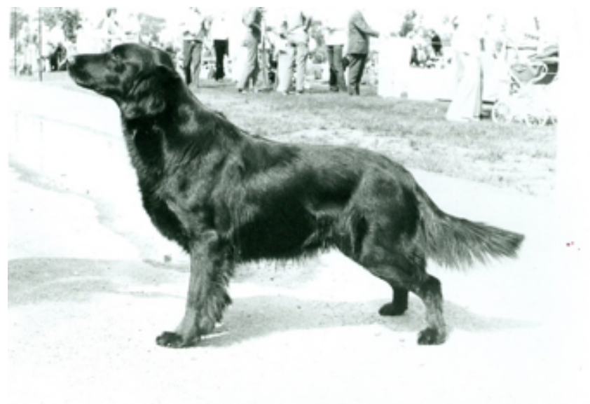
Black Penny of Yarlaw (top left), Downstream Hestia (top right), Puhs Herakles and Puhs Hestia.