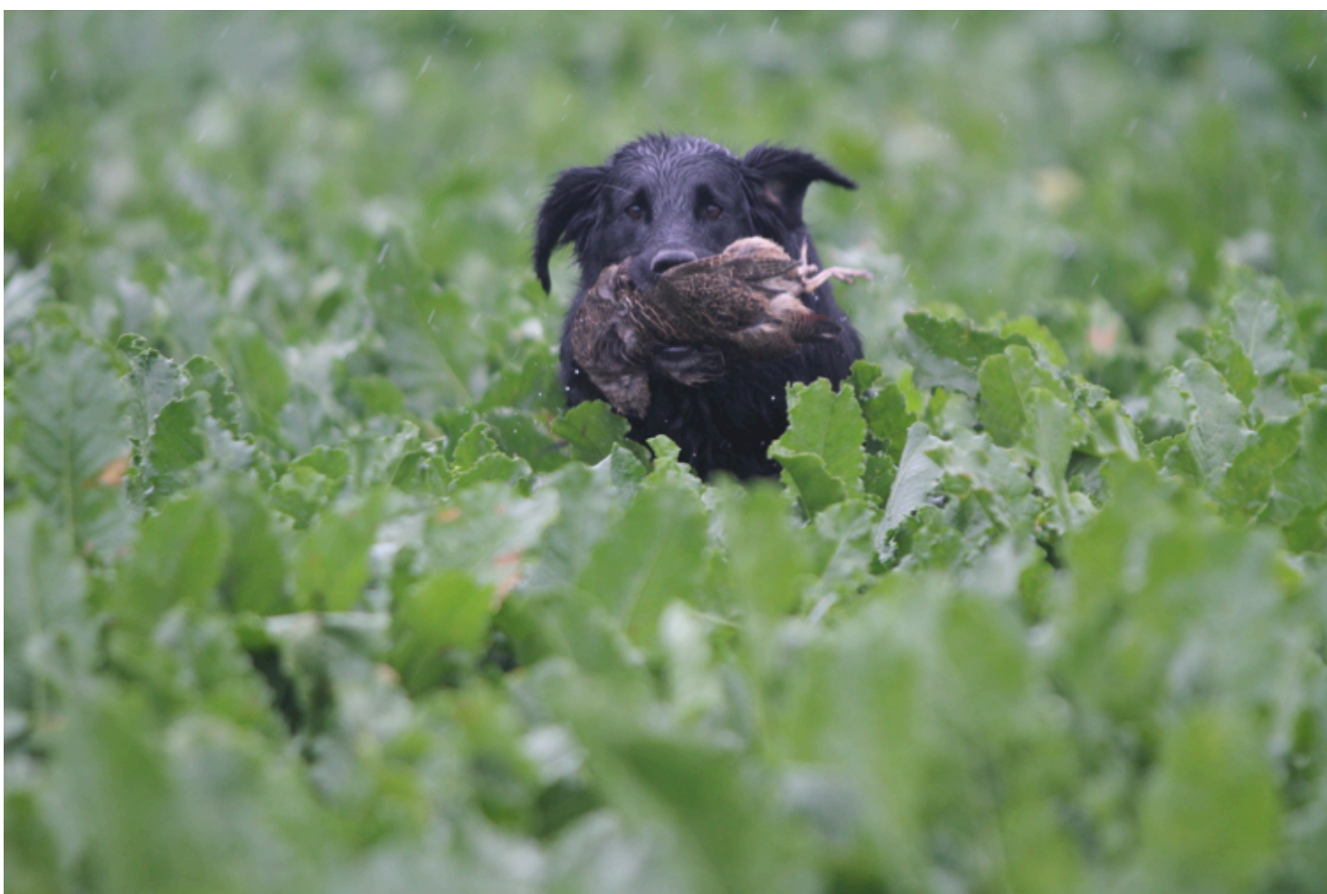
Coatfloat Marimekko, being one of the very best on the Swedish working scene, with an even list of merits from B-test, three 2nds a A-tests, two individual wins at the Nordic Championship and a Certificate of Merit at her one and only start at a British trial, the FCRS Open Stake in 2013.