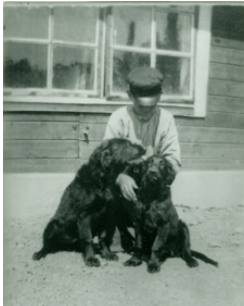
The Mälsåker Flatcoats around 1910 – showing a surprisingly good type.

The Flatcoat popularity decreased in England and the only Retrievers registered in Sweden before the nineteen forties were a few odd Labradors and Golden Retrievers during the thirties. Consequently, there are no bloodlines kept from those early Swedish Retrievers.