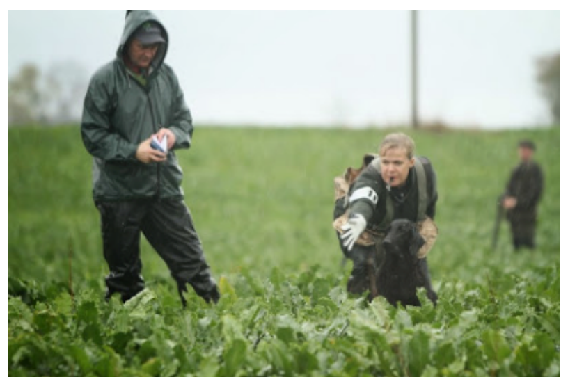
The Nordic Flatcoated Retriever Championship, Bäckaskog Castle, Kristianstad, Sweden 2014.