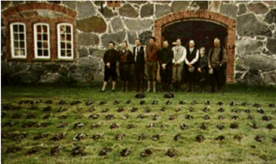
A team of guns honouring the game.