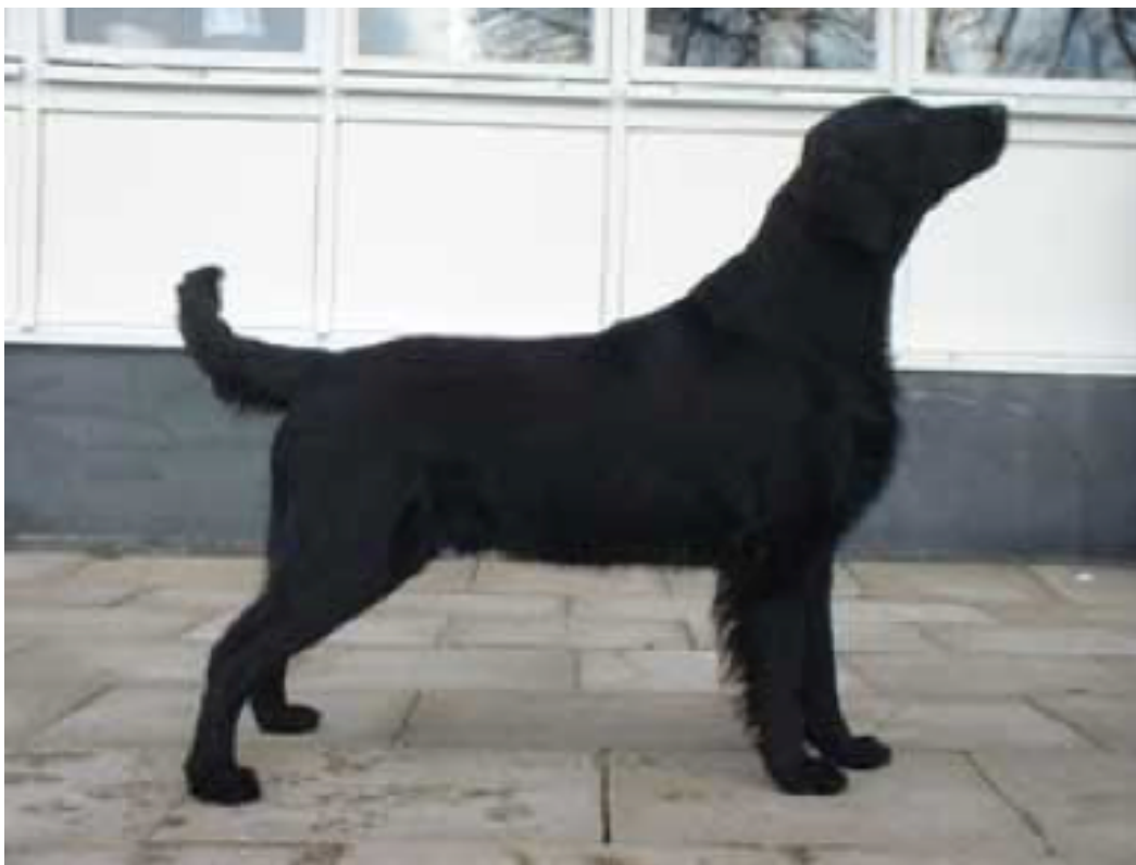
Inkwells Let It Be, a proven worker and a successful dual purpose stud dog.

The Inkwells kennel was a Dual Purpose oriented but strongly work focused breeder starting with Hovhills Chartreuse, a dual champion from the successful so called "Whisky-litter". She was mated to her own grandson to produce Inkwells Pair of Purdey. She in her turn produced Inkwells Cherry Herring for the Fågeltorps kennel and the latter was the dam of the successful Danish trialer Fågeltorps Jocke Orrtupp. Inkwells Nora Norlett, a granddaughter of Pair of Purdey, was probably their most successful trailer. She conquered the B-test championship title starting three times in Elite Class and she had a quite successful career at (any variety) A-test with a 2: nd price being the top result. The Dual Champion Inkwells Let It Be being successfully used by a number of work-oriented breeders.