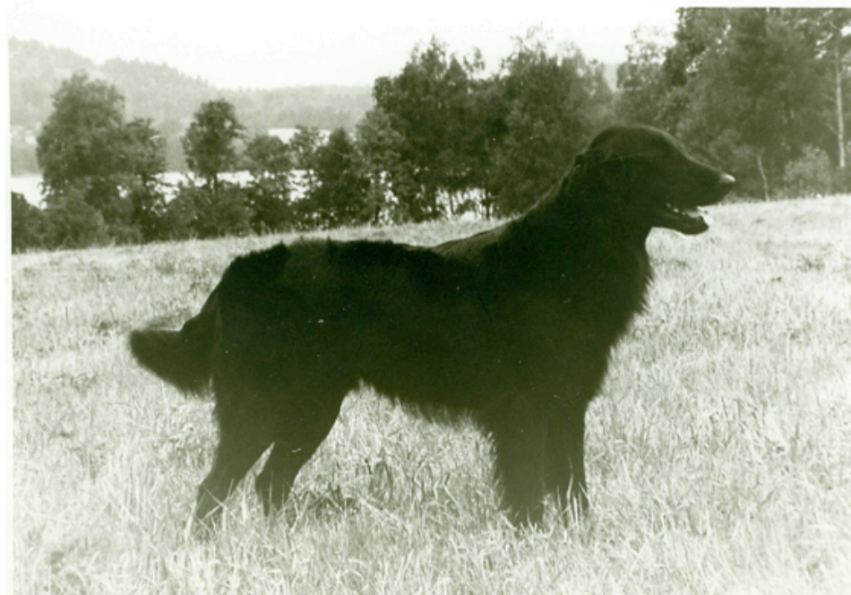
Quicksilver Courage (Courtbeck Mercury x Wyndhamian Carmella) had a strong impact on the working lines.